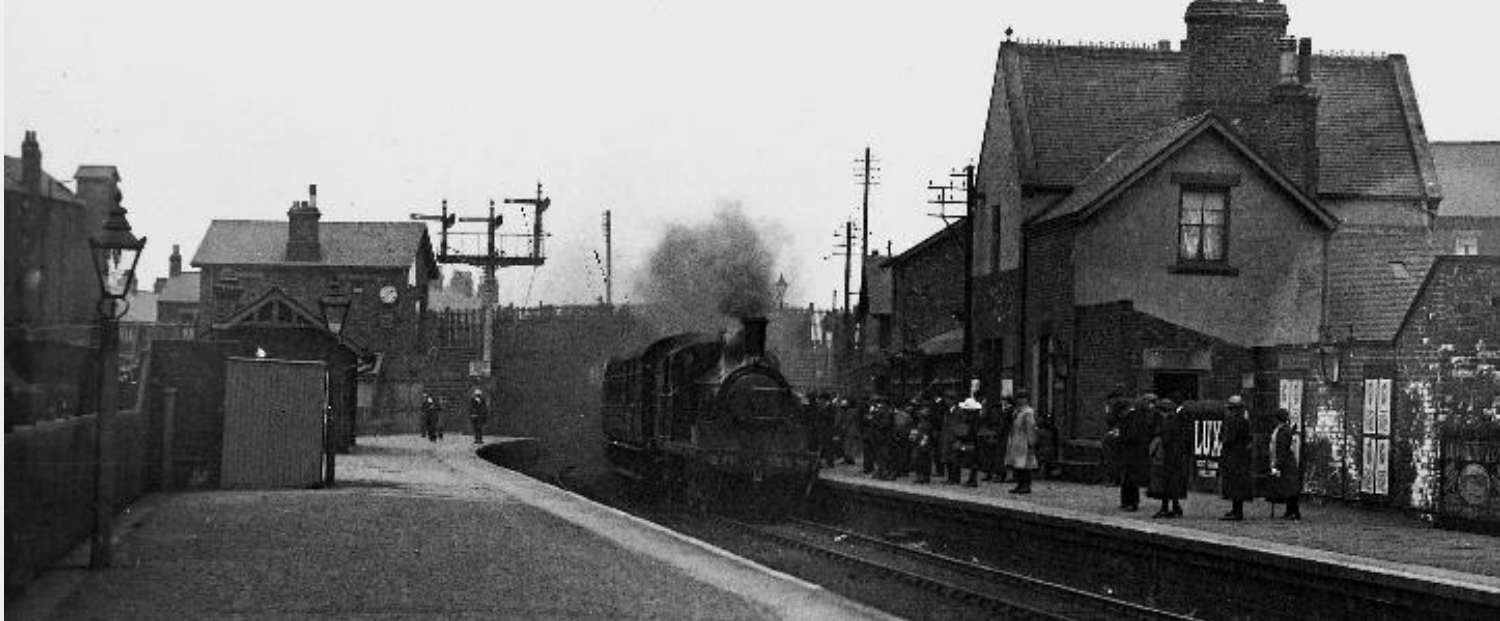
Ashington station c1920, with a North Eastern Railway BTP 0-4-4T arriving with a local passenger train.