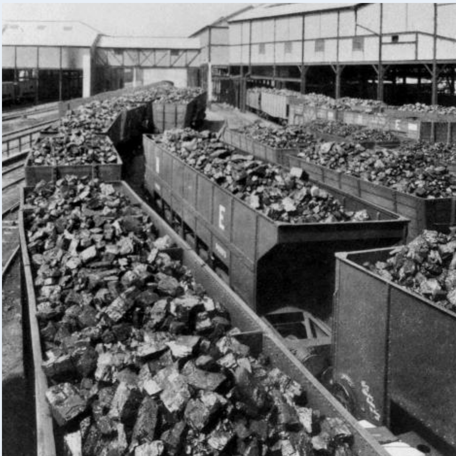
40-ton and 20-ton coal wagons at Ashington Colliery.

S ix miles north of Newsham was Ashington station, called Hirst until October 1889. It was one of two intermediate stations on the Blyth & Tyne branch to Newbiggin, the other being North Seaton. Hirst had facilities for passenger traffic and a modest goods yard