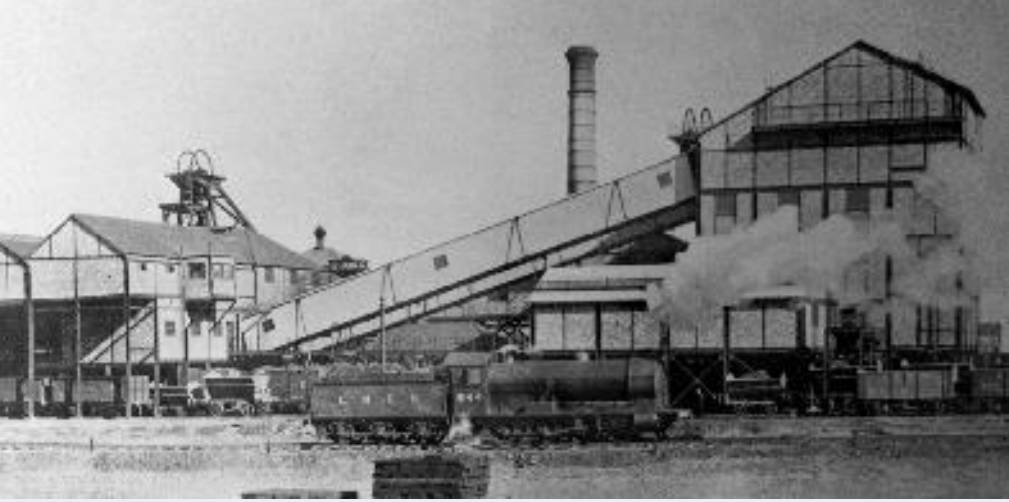
LNER Q5 0-8-0 No.644 (NER Class T) passes Ellington Colliery c1930.

platform was used for trains to and from Blyth. Alongside this platform were loops and sidings and there were four tracks as far as Newsham