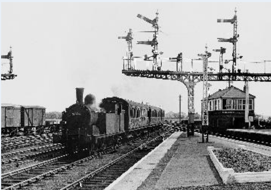
The 3.00pm train from Blyth to Monkseaton on the 'pass-by' line at Newsham with NER G5 0-4-4T No.67323 on 4th June 1958. Once clear of the points the locomotive would draw the train into the branch platform. (Ian S. Carr)

To set the scene before delving into the log books of Newsham North, it is necessary to explain its location and environment. When collieries were situated near a navigable river it was a comparatively simple task to transfer coal to ships, but as pit shafts were sunk further inland coal had to be transported over greater distances. Because Blyth harbour had limited loading facilities in those early days, waggonways were laid to the River Tyne. Gradually the output of more collieries in south east Northumberland was fed into these routes, culminating in the formation of the Blyth & Tyne Railway in 1853. As more staithes were built on both sides of the river at Blyth a great deal of coal traffic and general merchandise travelled through Newsham.