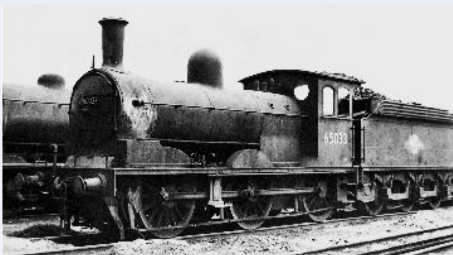
Four Class J21 0-6-0s remained in service in 1960 but were withdrawn shortly afterwards. No.65033, shown at South Blyth, was a regular visitor to Bedlington on local goods workings.

In 1901 it was reported in The Engineer that a T Class had hauled a demonstration train weighing 1,326 tons at Tyne Dock. It covered eleven miles in 52 minutes. Similar trials followed at Blyth —