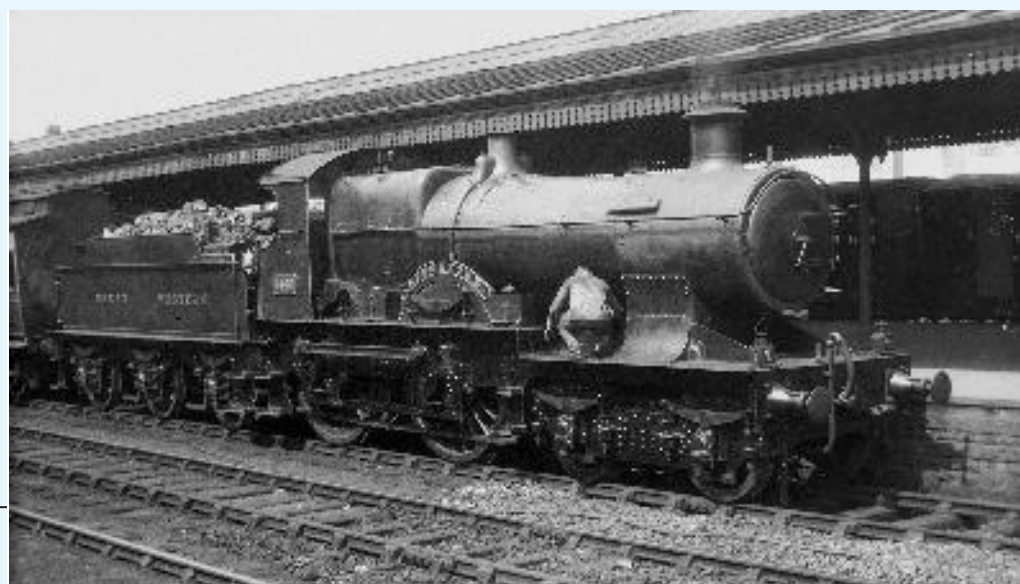
The driver is oiling round 'Atbara' Class No.4148 (previously 3417) Singapore before departure from Cardiff with an express. The 4-4-0 passenger classes were strongly represented in South Wales at this date, 1922.

Waterford's special boiler was one of the stage developments in the programme leading to the Standard No.2 boiler. By 1903 the design had reached an advanced stage, including the iconic taper, but development did not stop there. A larger version, the Standard No.4, was in production. In November 1903 Waterford's original boiler was replaced by one of these larger types, possibly to provide comparison with Earl Cawdor . In the years following, all but three 4 of the class were fitted with the Standard No.4 boiler, making the class effectively equivalent to the later 'Cities'. Subsequently the larger boilers were removed and replaced by long-coned Standard No.2, which leads us naturally into the next development.