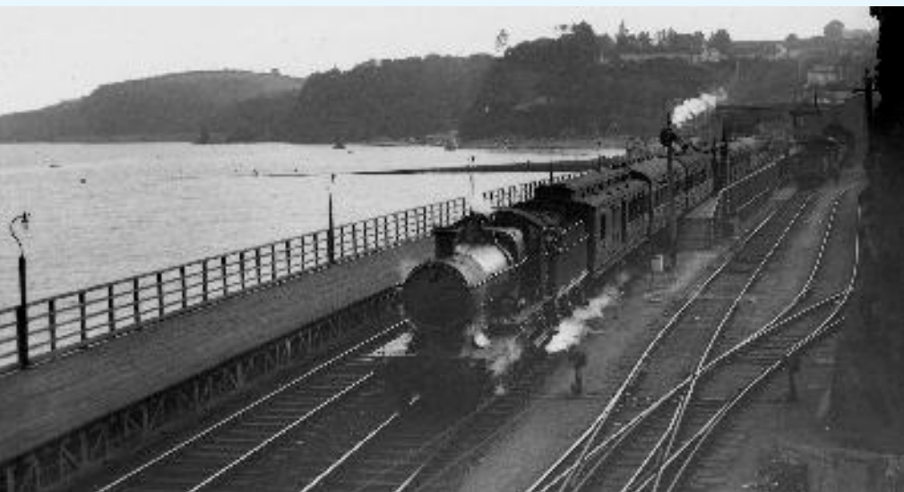
70 years ago 'Bulldog' No.3383 leaves Dawlish with an eastbound stopper. The date is 2nd September 1936 when the engine was fitted with a Standard No.3 boiler which necessitated the fitting of an extended smokebox; it reverted to the No.2 type in 1941 and remained in service until 1949, being withdrawn from Newton Abbot. The engine was built in 1903 as No. 3444 Ilfracombe , losing its name in 1930.

The success of the 'Badmintons' resulted in further building of 6ft 8ins engines with Standard No.2 boilers, commencing in 1900 with a series of 40 engines under Lot Nos. 125 and 126 all carrying the parallel version of the boiler. The date and specification made them contemporary with the Lot 124 'Bulldogs' to which they were similar except in terms of the driving wheel diameter. These engines therefore differed from the true 'Badmintons' in having straight frames and an 8ft 6ins wheelbase. The first engine to be constructed, No.4120, Works No.1826, was allocated the name Atbara . This also became the class name and derives from the name of a river which flows into the Nile near the township of the same name in Sudan, the locality being associated with Lord Kitchener's campaign of 1898. By 1900 Kitchener was engaged in the Boer War in South Africa and the naming of the first batch drew strongly upon the places and personalities involved in both conflicts. The names selected for Lot 126, however, were those of ports associated with Empire trade.