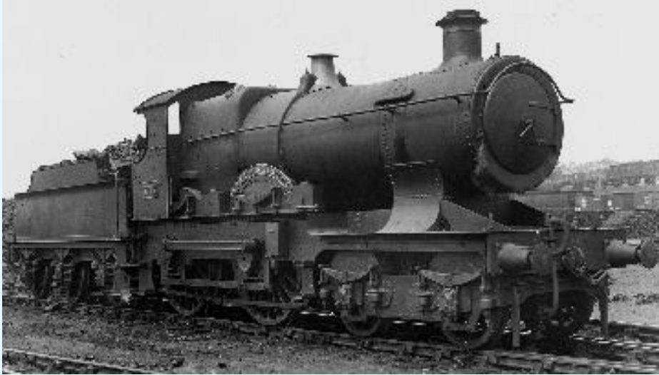
'City' No.3712 City of Bristol (built 1903). When introduced the 'Cities' took over the West of England expresses, then moved to the Birmingham and South Wales routes, on all of which they gave way to the 'County' 4-4-0s, Atlantics and 4-6-0s. They were the last of the double-framed line, withdrawal of the class being completed in 1931.

the 'Cities', were consolidated into one class known as the 'Flower' Class numbered 4100-4172. This consisted of the 'Badmintons', converted back to Standard No.2 boilers, the remaining 'Atbaras', the 'Flowers' proper and, amazingly, the four 'Armstrongs' now re-wheeled to 6ft 8ins diameter and sporting Standard No.2 taper boilers! In this way this honourable cohort laboured, filling unglamorous but essential duties on the secondary cross-country routes. This sort of work suited the smaller 5ft 8ins engines and they recorded many more years of useful life. However, the 'fast ladies', the high-stepping express engines, quickly became redundant and were retired in the late 1920s. The last 'Badminton' was No.4115 Shrewsbury 6 from Tyseley in March 1931 and the last 'Atbara' was No.4148 Singapore from Severn Tunnel Junction in May the same year. The last