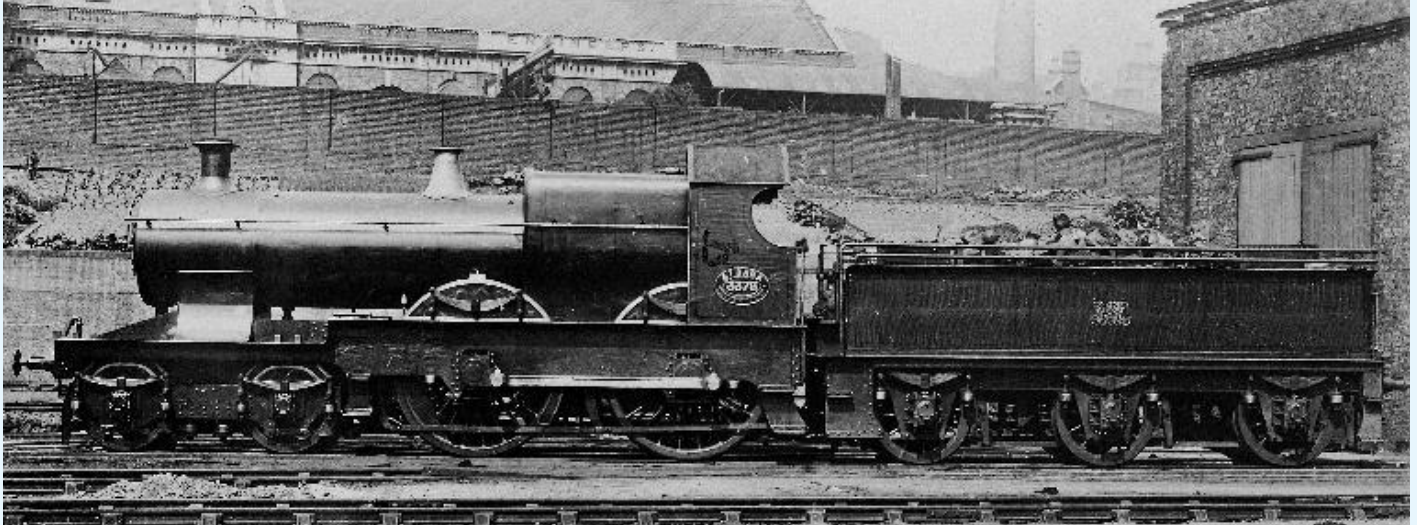
No.3373 Atbara as built, outside Westbourne Park machine shop. The first twenty of the 'Atbara' Class came out with combined name and number plates.

and were possibly an influence on what followed.